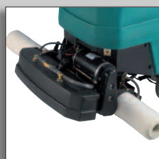
1610 - Rollers for maintenance cleaning