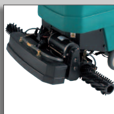
1610 - Brushes for restorative cleaning