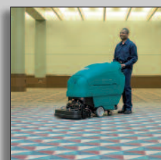
Machine in action